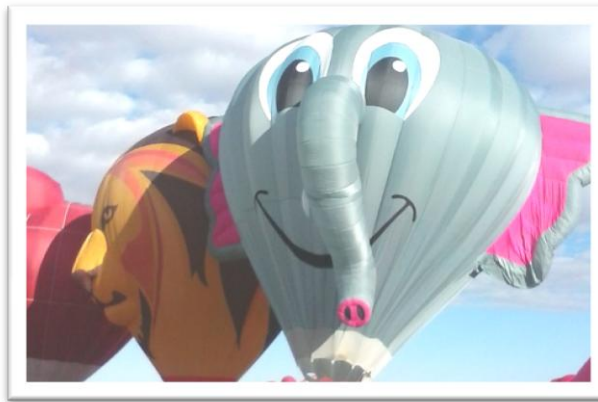
Albuquerque, New Mexico – Extended Trio Balloon Festival