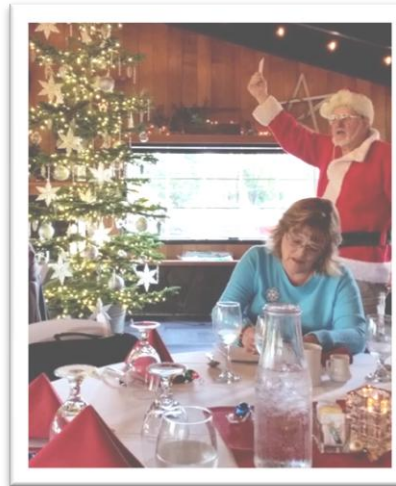
Christmas Party --

You don't have to be crazy to join us, but it helps!