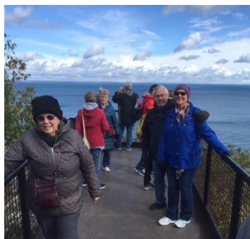
Clackamas Campers at Mackinac Is. Michigan