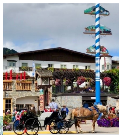
One Horse Power in Leavenworth