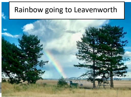
Rainbow going to Leavenworth