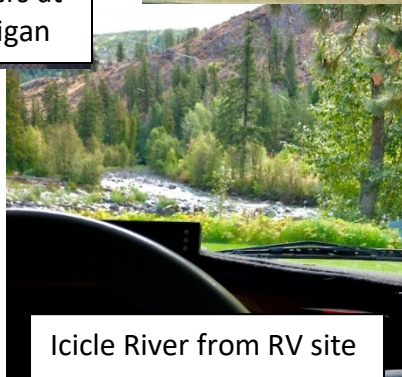
Icicle River from RV site